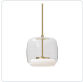
PD70610-CL/BG Clear/Brushed Gold