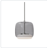
PD70610-SM/BN Smoked/Brushed Nickel